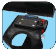
Fix the glove on the light with the supplied screw