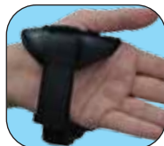
Tighten by pulling the velcro