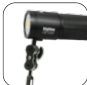
*Photographic Arms and Clips are sold separately